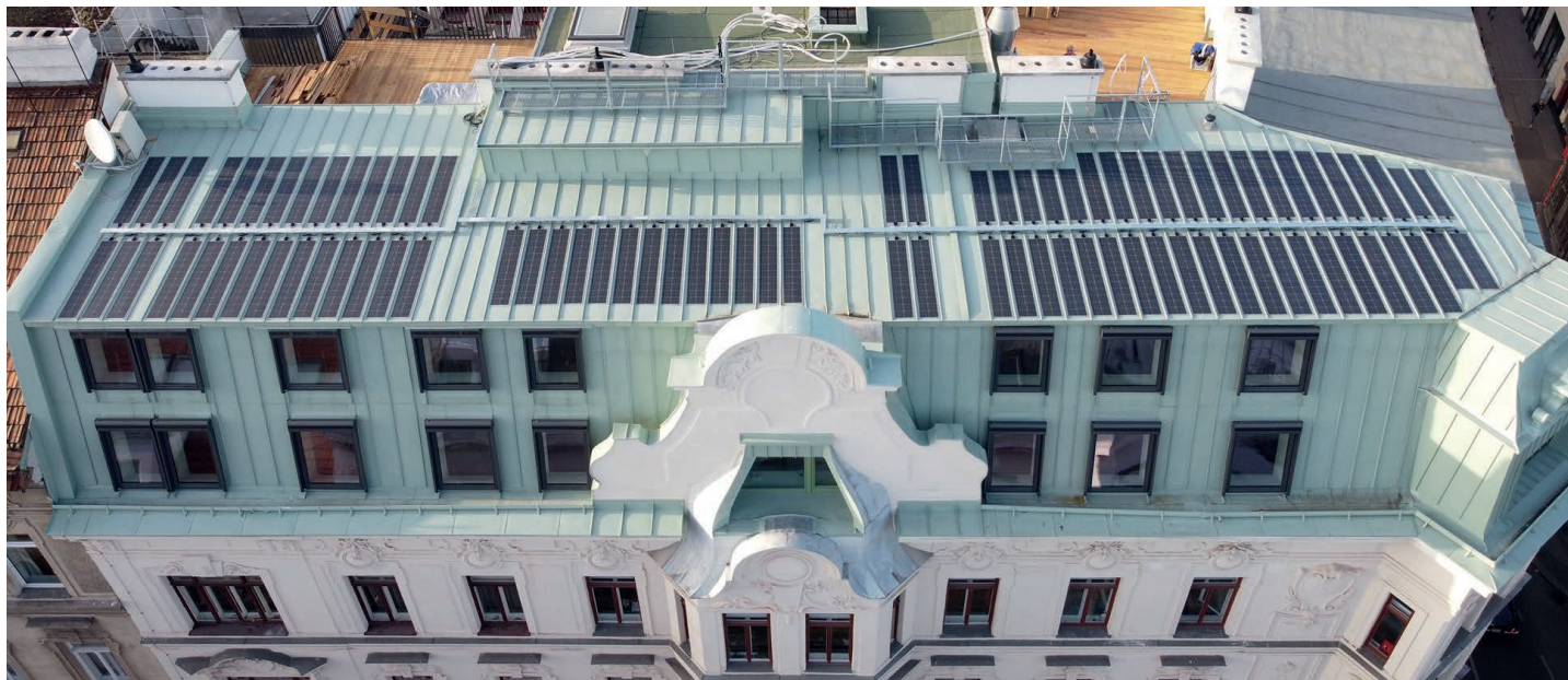
Rooftop installation private top floor

RJB = rear junction box FJB = front junction box